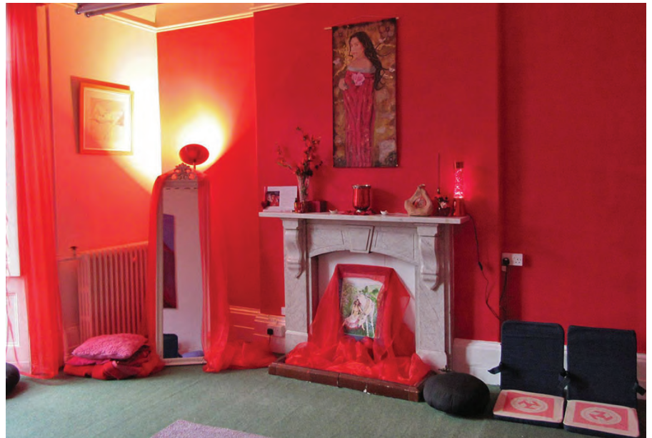
Rhiannon Room, Goddess House

The Temple is once more dressed in red and ready for ceremony; sacred marriage,