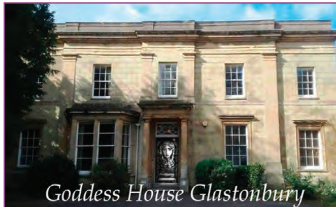
Goddess House Glastonbury

Full information & book online: www.goddessconference.com Email goddessconference9@gmail.com