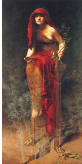
"Priestess of Delphi" by John Collier, 1891

The earliest Oracles in Greece were Priestess Sybils who spoke directly for the Earth Mother Ge or Gaia, from deep inside caves within Her body, the Earth. They embodied the Nymphs and Muses who inspired the people. At Delphi Priestess Oracles first spoke for Ge in trance, sitting on a high rocky outcrop, or above a crack in the volcanic rock from which intoxicating gases emerged. In classical times as the patriarchal Gods took over the ancient places of the Goddess, the Sun God Apollo killed the chthonic female Python or Earth Serpent and claimed Delphi for himself. Throughout classical times travelers came