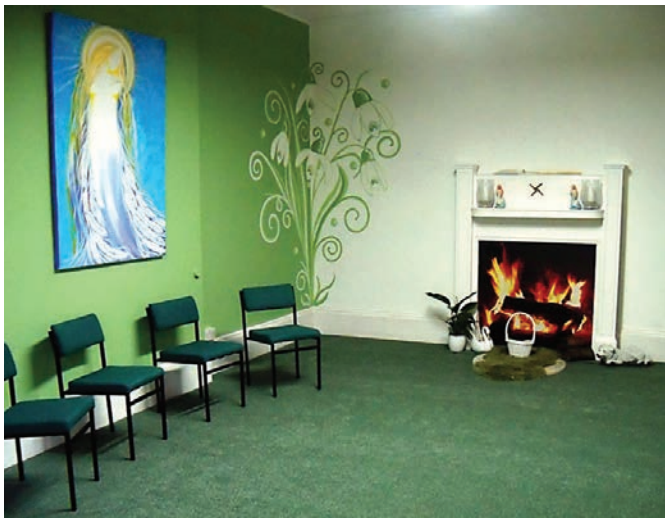
The Brighde Room

Our Goddess Deluxe Therapies have become the creme de la creme! These bespoke therapies work with the energy of a specific Goddess from the Wheel of Avalon. They work at a deep soul level to bring relaxation, healing and connection. Recently we have decided to expand these and are now running Goddess Retreat Days where people can immerse themselves in Goddess for a whole day. These special days can be organised for individuals and for groups coming together. They include a sacred journey to connect to a specific Goddess through ceremony, with Priestess blessings, guided visualisation, massage therapies, healings, readings, meditation and pampering.