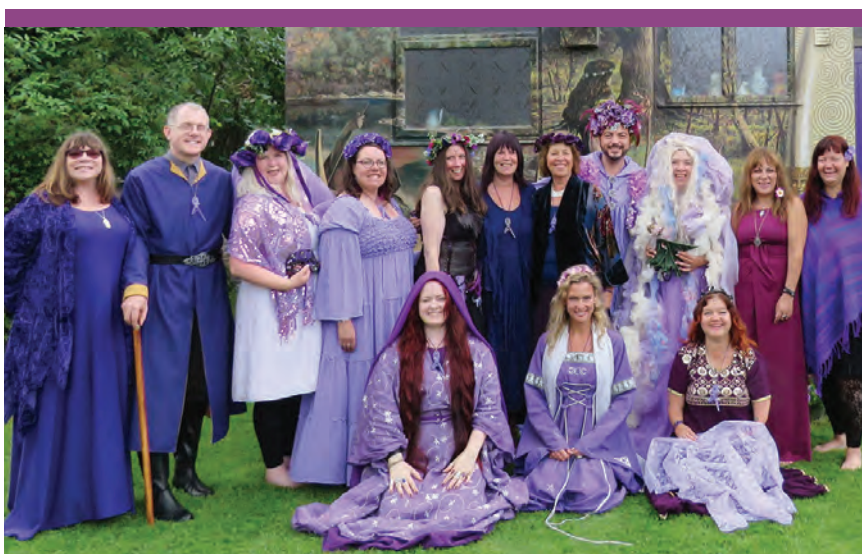
Congratulations to the newly initiated Priestesses/Priests of Avalon (10 Jul 2016)