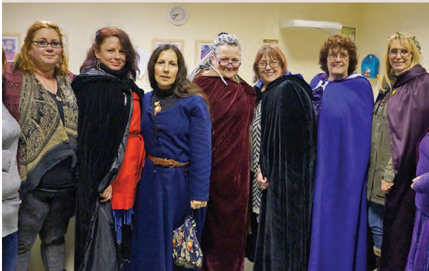
Norfolk Goddess Temple members