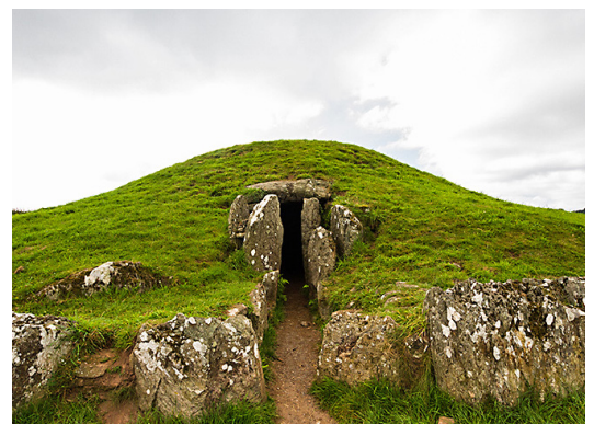
Bryn Celli Ddu