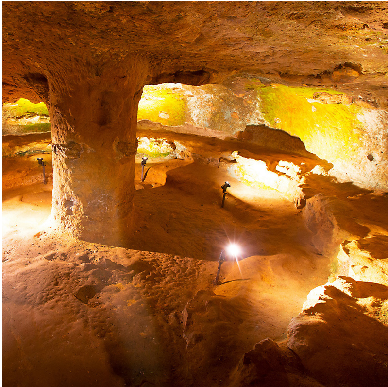
Etruscan Chamber Tomb