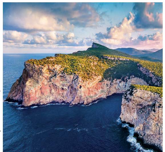
Island of Sardinia, Italy